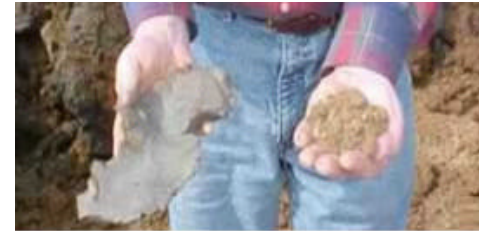
Clay soil, before and after lime modification

Small amounts of lime, such as 1 to 4 percent by mass of dry soil, can upgrade many unstable fine-grained soils. With heavy clay soils, additional lime may be necessary for these purposes. Modification improvements are generally temporary and will not produce permanent strength in clay soils.