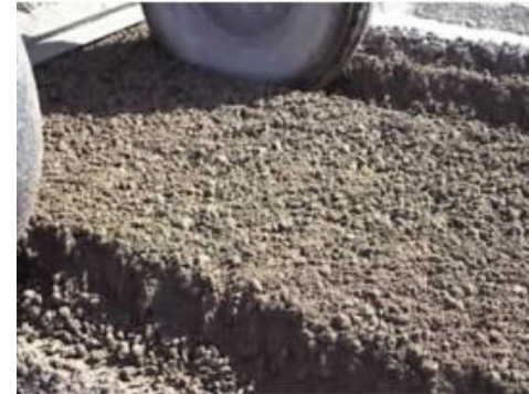
Lime flocculating clay