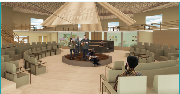
Central Theatre (Seating for 100+)