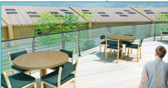
Outdoor Patio Balcony