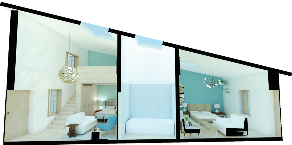
Apartment Section View Showing entryway, downstairs studio living room, stairs to loft, bathroom

Estimated Square Feet: 30,000 sq ft (2,787 sq meters)