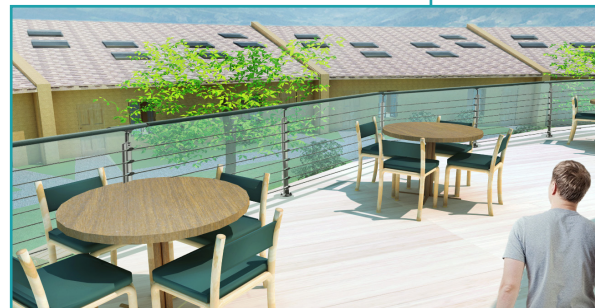
Outdoor Patio Balcony