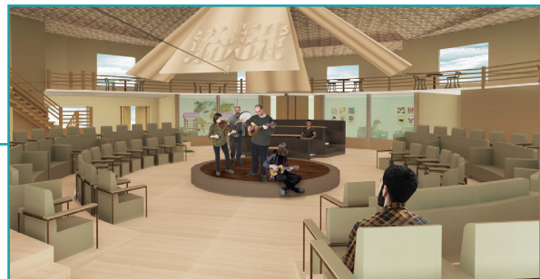
Central Theater (Seating for 100+)