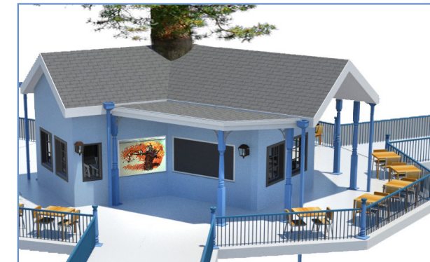
Library, Play, Game Rooms (4)