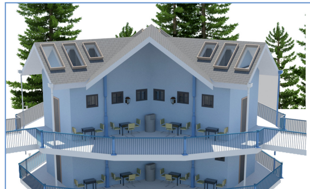
Shower/Bath Towers (3)