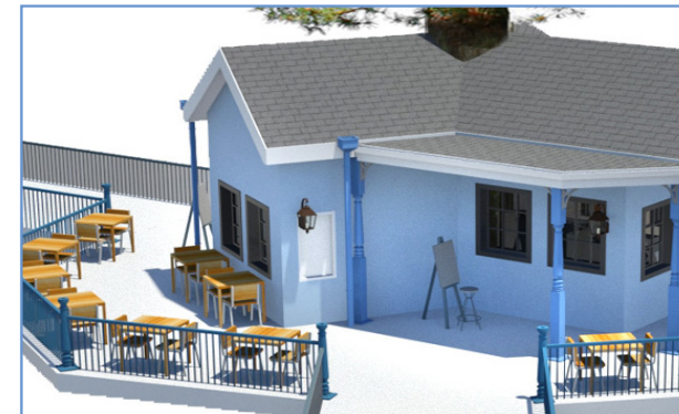
Arts & Crafts Rooms (2)