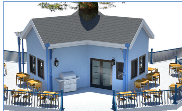
Group Kitchens (2)

The final planned village of the first 7, the Tree House Village is intended to demonstrate an off-ground and low-footprint, low-impact housing approach to sustainable living in the trees. The theme of this village is “Eco-expressionism” and we intend to use this village to demonstrate a unique win-win living experience for both people and a forest environment. In so doing, our desire is to expand the viewpoint of the general population for what is possible with eco-artistic sustainable housing and the benefits it provides for both society and the planet. View the Online Open Source Hub: www.OneCommunityGlobal.org/Tree-House-Village