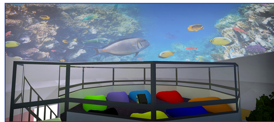
The Ultimate Classroom also includes integration of a central 360° ceiling projector.