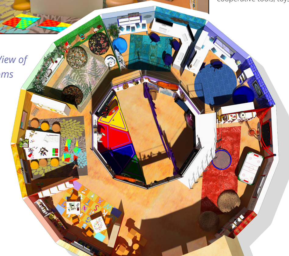
Top-down View of all Classrooms

This classroom is part of the One Community Highest Good Education component that also includes open source all-ages curriculum guides and lesson plans, teaching strategies, learning tools and toys, evaluation models, and more: www.OneCommunityGlobal.org/Highest-Good-Education